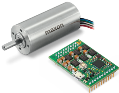
EC-4pole 30 brushless DC motor

During many surgical procedures in the operating room, the surgeon relies on battery powered power tools. These tools are used when surgeons need to saw through bone or drill holes. This is frequently the case in trauma surgery, if hands or feet are involved or in hip joint surgery. With the EC-4pole series, maxon offers the perfect drive solution for this purpose. The brushless electric motor has two pole pairs, resulting in very high power density and high torque. Another impressive feature is its ability to withstand 1,000 autoclave cycles.